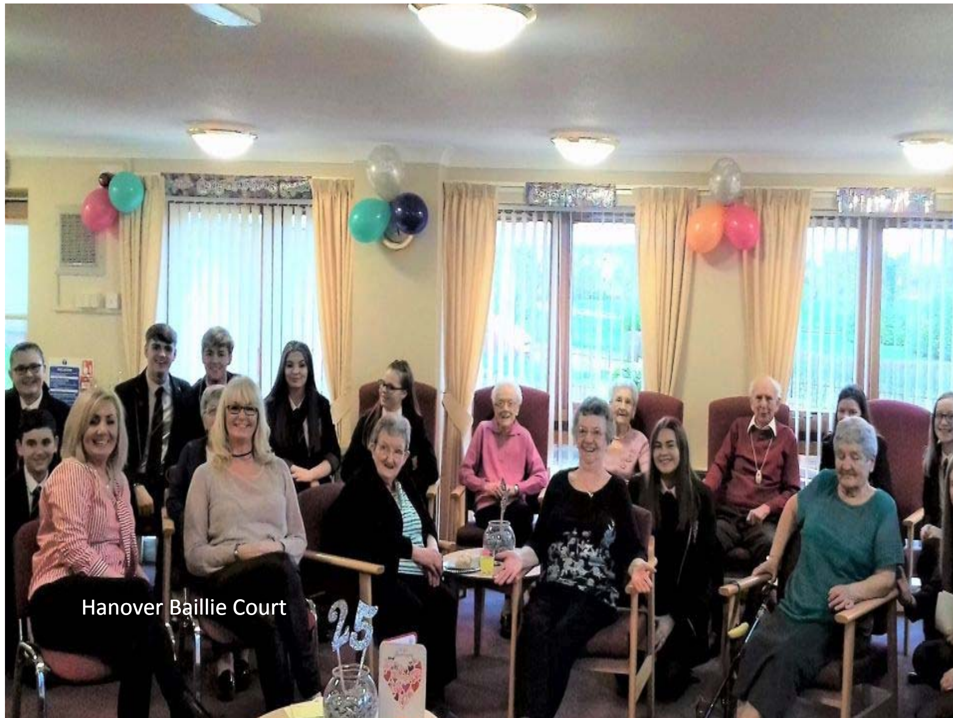
Hanover Baillie Court