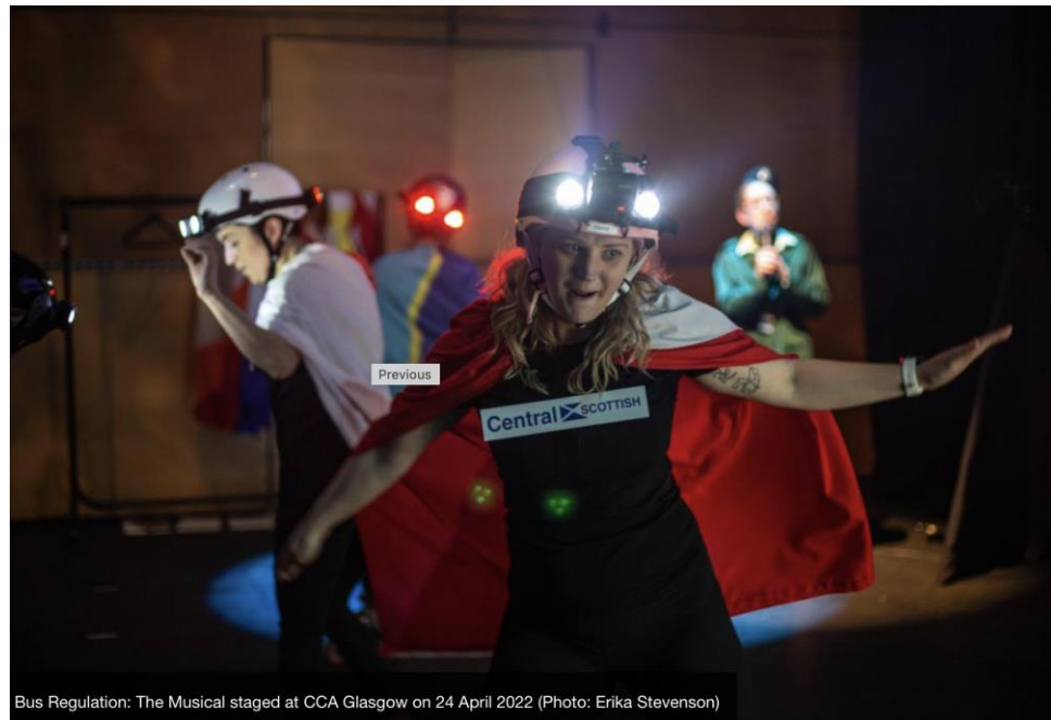
Bus Regulation: The Musical staged at CCA Glasgow on 24 April 2022