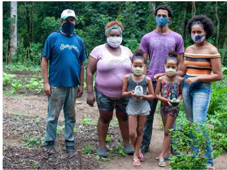
A Quilombola's family. Rio de Janeiro Metropolitan Area. 2021