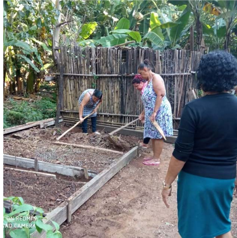
2. Emporio da Chay