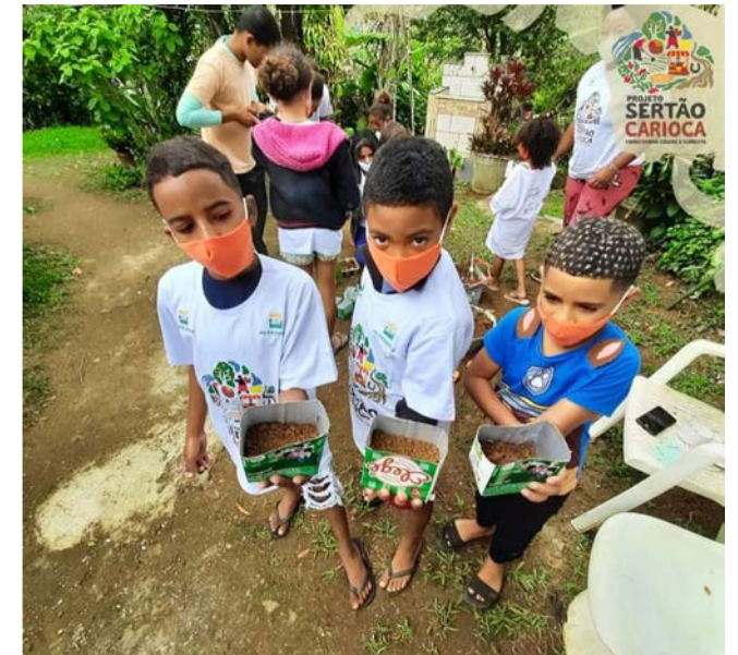
Children from Quilombo Cafundá Astrogilda. Environmental workshop. 2021.